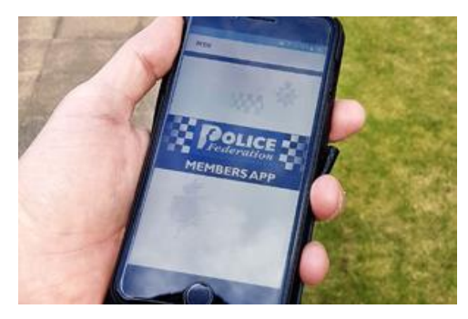
PFEW app gets a refresh - download it now for all the latest news and updates

We believe that a holistic, independent and full review of policing is long overdue. The government's Policing for the Future inquiry aims to "explore the challenges of modern policing". Our response highlights the need for a police service that delivers what the public want and can effectively tackle changing crime patterns. We said that you need the right equipment, training, rewards, resources and legal protections to deal with the demands placed on you.