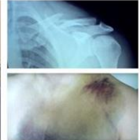
Our Protect the Protectors campaign gains wider MP and union support