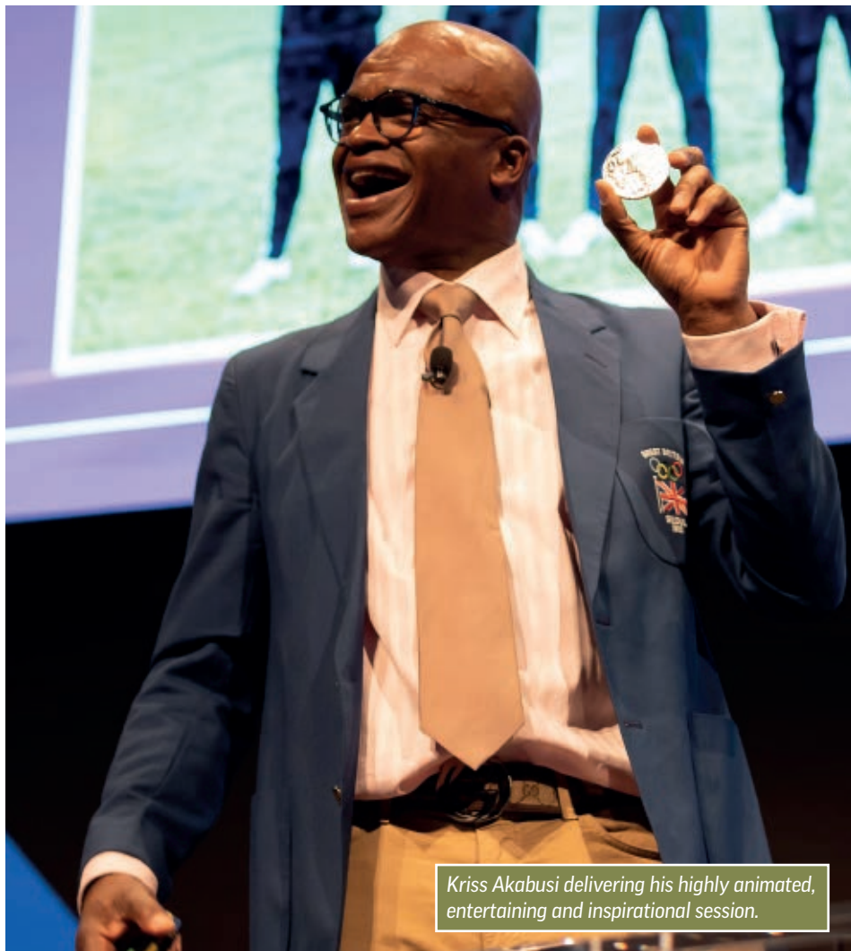
Kriss Akabusi delivering his highly animated, entertaining and inspirational session.