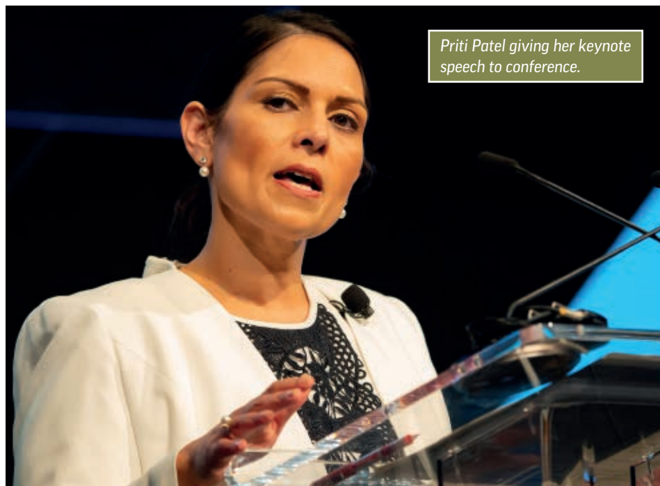
Priti Patel giving her keynote speech to conference.